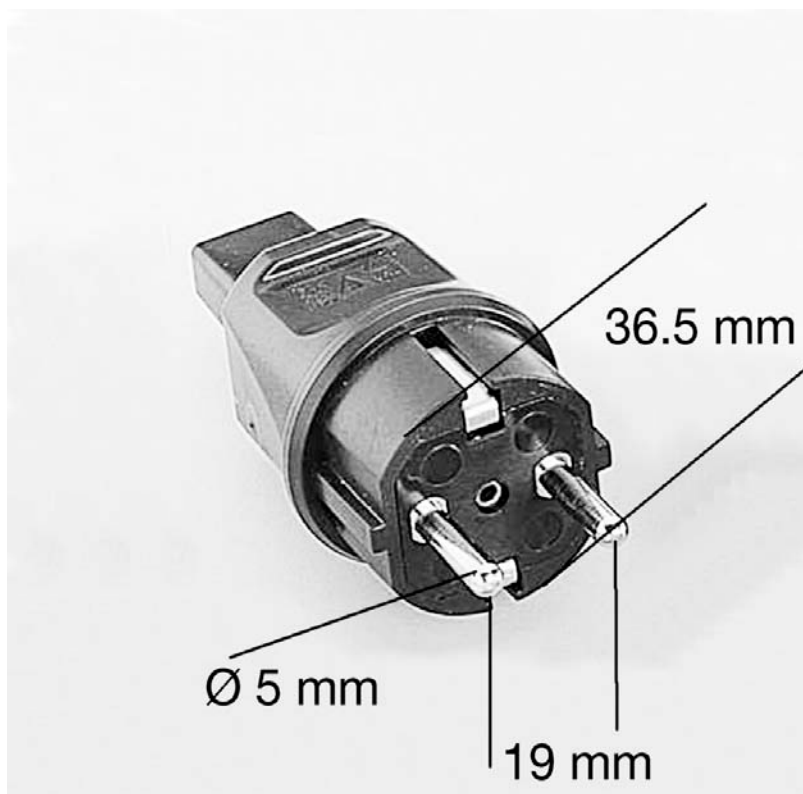
German 220 Volt/50Hz Powerplug