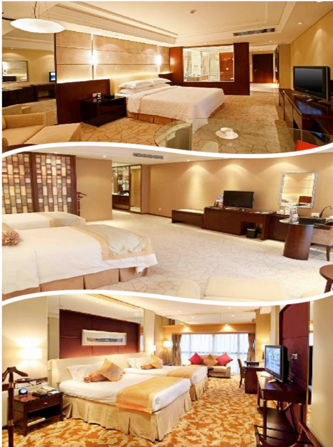
Room type of Guo Run Traders Hotel (Hotel C): 500-700RMB/ room / 2 beds.