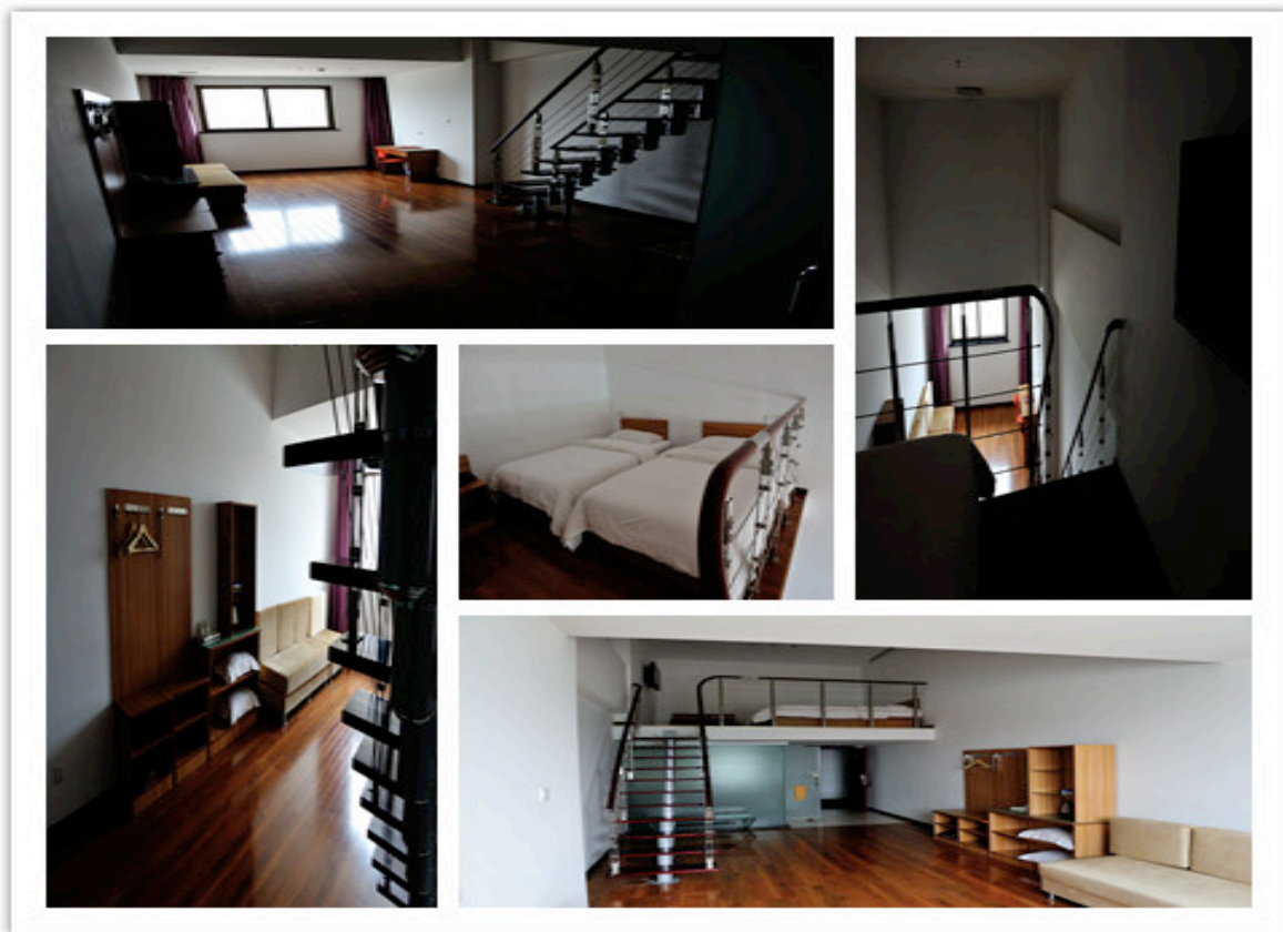
Room type of West International Trade Hotel (Hotel B): 500-1500 RMB / room / 2 beds